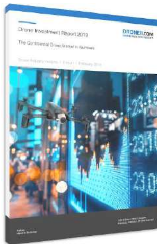
Drone Investment Report Investments, values and investors