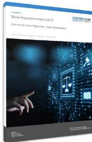
Drone Regulation Report Drone Readiness Index