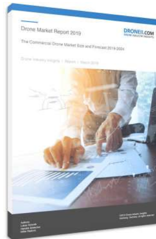
Drone Market Report Market Size and Growth 2019-2024