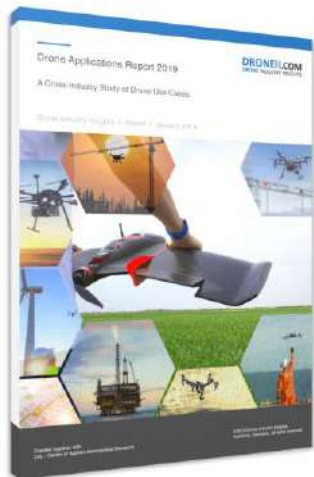
Drone Application Database Commercial Drone Applications